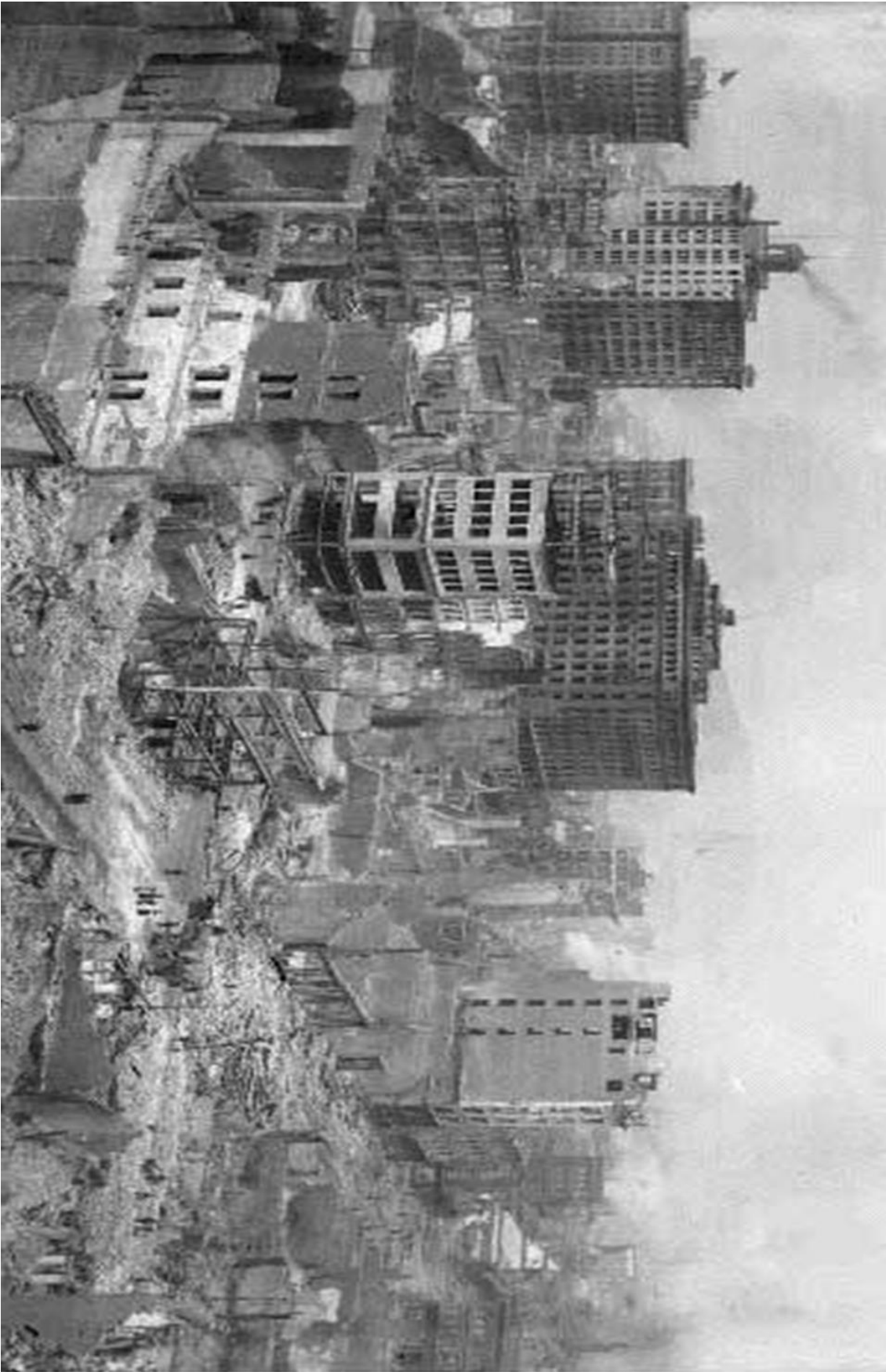
Panorama of destroyed city